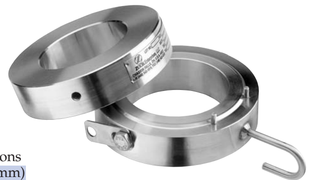
Holder Dimensions Inches (mm)

Gauge tap; nipple and tee; excess flow valve; pressure gauge; special facings and coatings